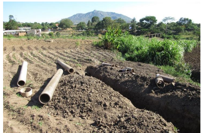
Sewage line repair