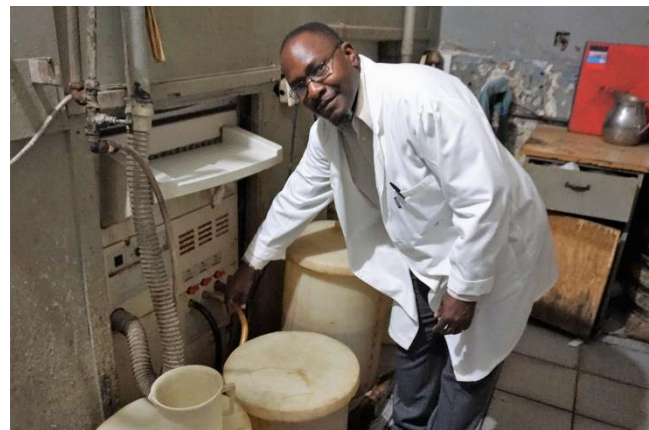
Disposal of chemical waste at QECH

It was observed during initial site visits that chemical waste from the hospital's laboratory and radiology department was being inappropriately disposed of through the sewer network, with an untold effect on water quality downstream. Upon learning of the regulations for chemical waste disposal, the site enlisted support from the Blantyre City Council to advise and support the hospital to implement proper chemical waste disposal and treatment, which is underway.