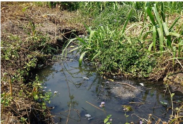
Untreated waste from sewage line

Wastewater from QECH is collected and treated at the Blantyre City treatment works, however it was found that the sewer line which transports all of the hospital's waste was broken some 300 meters from the site's boundary, and that the waste was flowing over residential and farm land and into the Naperi river. This situation posed a severe public health risk. Blantyre City Council are responsible for operation and maintenance of the sewerage network and the issue was taken up with them by the QECH team. QECH's engagement of the Council initiated the repair of the sewage line, ensuring the proper treatment of wastewater from the hospital and improving the water quality of the Naperi river.