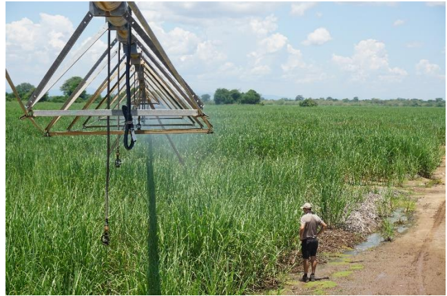
Irrigation at Kaombe Estate