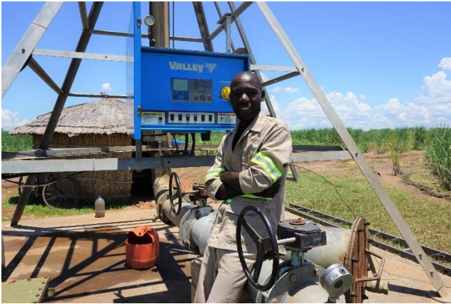
Center pivot irrigation operator

As a large-scale agri-business, the Kaombe Estate must abide by environmental and water-related laws and regulations. Through Standard implementation, Agricane will develop a robust system for ensuring and tracking legal and regulatory compliance. Furthermore, the Standard will guide the site to align with and contribute to water-related public-sector initiatives, namely the Management Plan for Elephant Marsh.