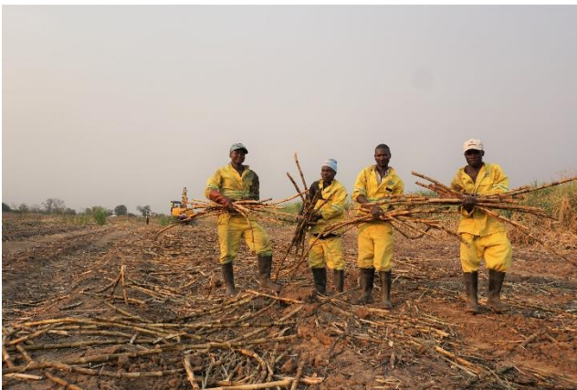
Staff cutting cane at Kaombe Estate