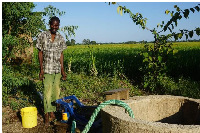
KASFA member at shallow well

potentially contaminate the water, including the grazing of livestock and washing of clothes and other domestic items.