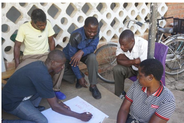
KASFA water stewardship plan development

Prior to implementation of the AWS Standard, tree-planting was a regular annual activity implemented by KASFA, with support from NASFAM. However, prior tree-planting efforts were not carried out strategically, and the survive rates of trees were generally poor. Given that catchment degradation and floods were identified as priority water risks by KASFA farmers, tree-planting was chosen as one of the key activities under KASFA's water stewardship plan. However, KASFA recalibrated their tree planting efforts to address the issues of catchment degradation and flooding by planting along riverbanks and in the heavily deforested areas. In consultation with the District Government, KASFA identified one catchment area as a priority for planting. In total, 8,257 trees were planted in 4 wards. It is hoped that by planting trees strategically, KASFA will be able to improve the health of important water-related areas in the catchment and mitigate flood risks.