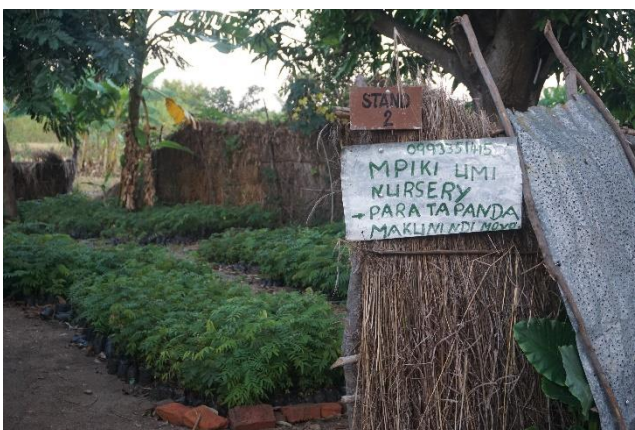
KASFA member tree nursery