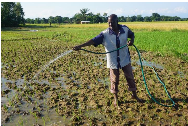
Irrigation from shallow