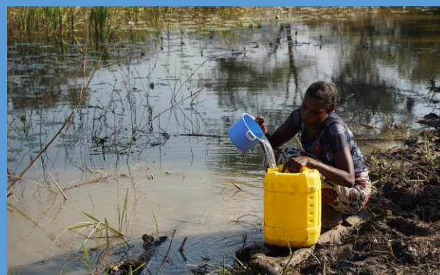
Water supply in Sikaunzwe Ward

Sikaunzwe also suffers from poor water supply coverage – only 45-50% of the population has access to a sustainable water supply – high levels of groundwater salinity, and a lack of water storage. The main sources of domestic water supply are rivers, streams, burrow pits, and dambos. However, during droughts and floods, which are a common occurrence, the water supply becomes even more precarious. Flooding causes contamination of unprotected water sources, and when water sources dry during drought, residents travel as far as 15 kms and spend upwards of 6 hours a day fetching water. Some families are even forced to temporarily migrate to the banks of the Zambezi to find water.